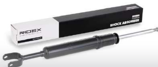
SHOCK ABSORBERS WITH SPRING SEAT