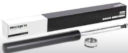
CARTRIDGES FOR SHOCK ABSORBERS