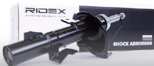
MACPHERSON GAS-CHARGED CARTRIDGES