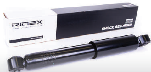
TWIN-TUBE TELESCOPIC SHOCK ABSORBERS